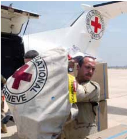
Photograph: Department of defence